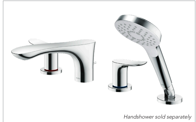
Handshower sold separately