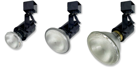
shown with PAR20