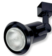
NTH-124B Black Cone