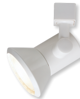
NTH-124W White Cone