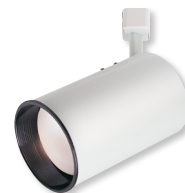
NTH-101W White Flatback Cylinder with Black Baffle