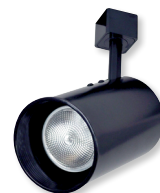
NTH-101B Black Flatback Cylinder with Black Baffle