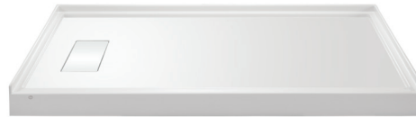
Color matched SculptureStone® hidden drain cover comes standard on white base.