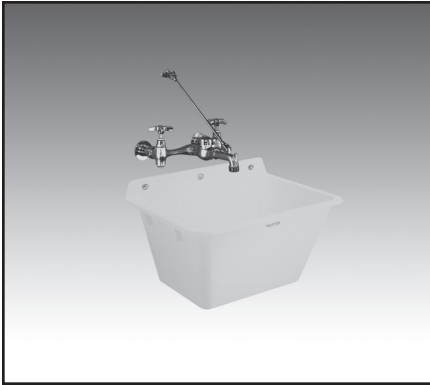
Shown with optional 63.600A Mop Service Faucet